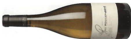
Clos des Rocs, En Chantone, Pouilly-Loché 90 SB 90 ED 90 MW 89

Restrained, savoury stone fruit aromas plus herbs and lemon balm. Bright, racy and zesty, the palate has a citric tang and a pithy, saline finish that shows tension. Atypical, but attractive and long. Drink 2018-2023 Alc 13%