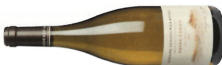
Domaine Sangouard-Guyot, Au Brûlé, St-Véran 90 SB 88 ED 92 MW 89

A vigorous nose of mango, melon, stone fruits, oatmeal and apple blossom. Rich and voluptuous in the mouth, it has a crisp edge of citrus and floral notes. This needs a bit more time to fully integrate, but is showing its potential form. Drink 2018-2022 Alc 13%