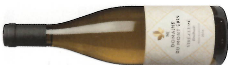
Domaine du Mont Epin, Breillonde, Viré-Clessé 90 SB 90 ED 89 MW 92

A savoury, chalky nose is bolstered by quince, citrus and kumquat. Vigorous, youthful and intense with a saline richness, bold acidity and a nervy mineral finish. Drink 2018-2021 Alc 13%