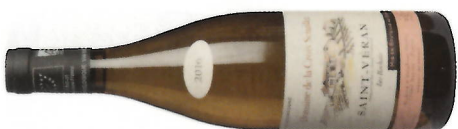
Domaine de la Croix Senaillet, Les Rochats, St-Véran 90 SB 88 ED 92 MW 91

Chalky, mineral aromas – almost Chablis-like – with stone fruits, citrus and white flowers. It's creamy in texture, with lemon, green apple and a hint of mushroom leading to a spicy finish. Drink 2018-2021 Alc 13%