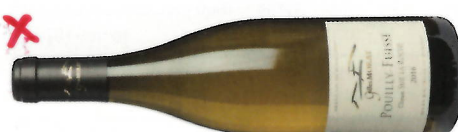
Gilles Morat, Terroir de Vergisson, Pouilly-Fuissé 90 SB 89 ED 90 MW 92

Delicate apple and apricot aromas are joined by patisserie cream, cedar, chalk and nuts. The palate is brisk, with notes of preserved lemon, sea-salt, vanilla pod and sweet citrus fruit. It manages to marry elegance with power. Drink 2018-2022 Alc 13.5%