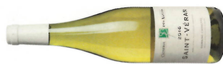
Closierie des Alisiers, St-Véran 90 SB 90 ED 91 MW 90

Spicy, waxy aromas are joined by apple pie and stone fruits. To taste, it's creamy, textured and rich. The acidity provides the perfect foil to the concentration and density, leading to a lively finish. Drink 2018-2021 Alc 13.5%