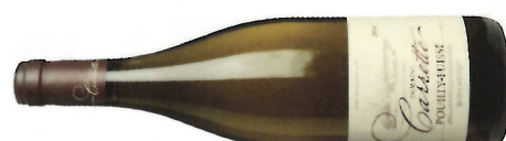
Domaine Carrette, Ronchevat, Pouilly-Fuissé 90 SB 91 ED 89 MW 91