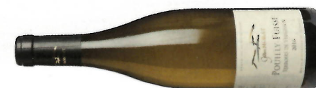
Rijckaert, Les Vercherres, Viré-Clessé 90 SB 89 ED 93 MW 87

Rich, buttery aromas of mango, citrus, apricot compote and honey lead into a full-bodied, creamy palate layered with fruit and spicy oak. This is complex, full-throated and ambitious, with a long and zesty finish. Drink 2018-2021 Alc 13%