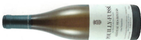
Château des Rontets, Clos Varambon, Pouilly-Fuissé 90 SB 91 ED 88 MW 90