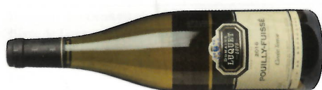
Domaine Luquet, Cuvée Terroir, Pouilly-Fuissé 90 SB 90 ED 92 MW 88