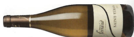
Domaine Ferrand, Le Vin au Feminin, St-Véran 90 SB 89 ED 90 MW 91

Citrus, stone fruit and oak aromas. Bright and zesty flavours replicate the nose. The oak is slightly obtrusive now but should integrate into the weighty palate. There's white pepper on the long finish. Drink 2018-2021 Alc 13%