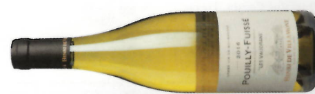
Henri de Villamont, Les Vaudrans, Pouilly-Fuissé 90 SB 89 ED 90 MW 91

'Some of the top Pouilly-Fuissés here were really classy – they had power, density, complexity and showed the potential of the appellation' Stephen Brook