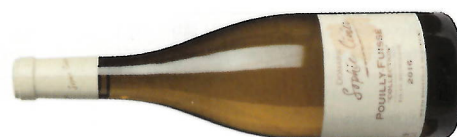
Domaine Sophie Cinier, Collection, Pouilly-Fuissé 90 SB 87 ED 92 MW 91

Savoury but ripe melon on the nose, along with touches of orange, papaya, apricot and hazelnuts. Fresh but silky, the palate has a biscuity spice with gentle, creamy undertones and a long, finely spiced, perky finish. Drink 2018-2020 Alc 13%