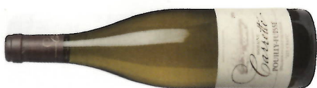
Domaine Carrette, Les Crays, Pouilly-Fuissé 90 SB 92 ED 89 MW 90

A reticent nose of ripe melon, tangy cream and a light, smoky tone. There's a nice texture to the palate, with flavours of ripe green apple, citrus and quince, plus mineral undertones. Pure, bright and complex, with lovely integrated acidity. Drink 2018-2021 Alc 12.5%